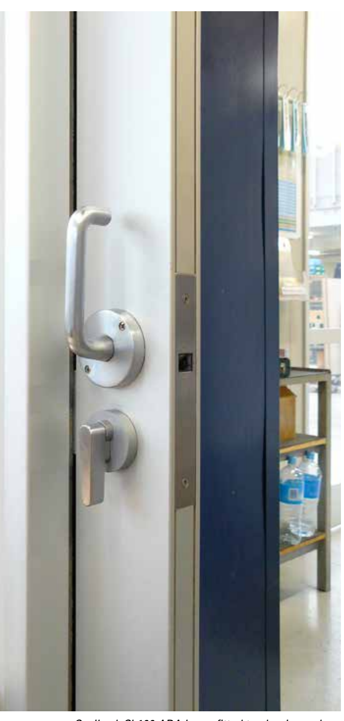
CaviLock CL100 ADA Lever fitted to aluminum door.