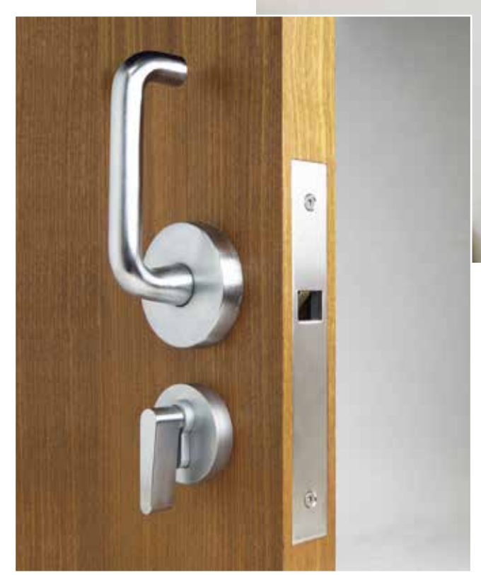
CaviLock CL100 ADA Lever on timber door.