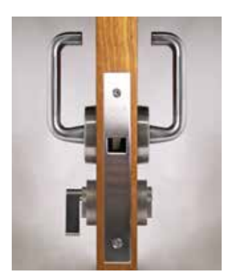
CaviLock CL100 ADA Lever Turn/Key option

IMPORTANT: Operable parts of hardware must be mounted 34" (865mm) min. and 48" (1220 mm) max. above finished floor to meet ADA guidelines. The clear width of the door opening must be a minimum of 32". Always check State and Federal guidelines relating to the specific project.